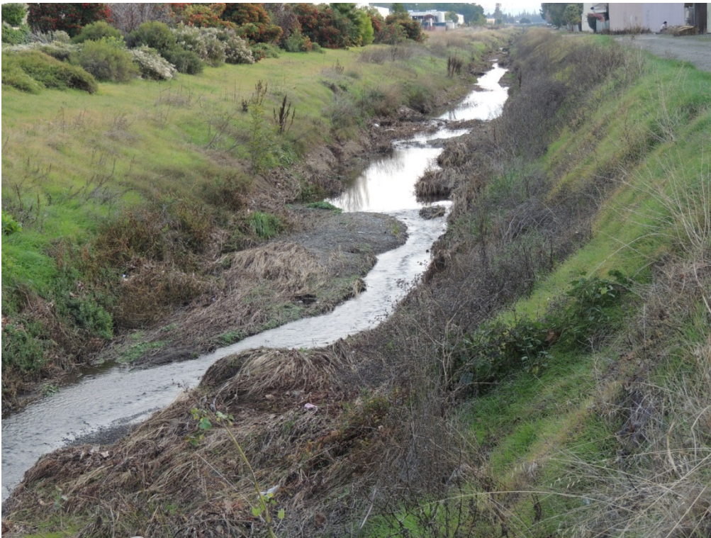
Upper Berryessa Creek looking upstream from creek crossing at Los Coches