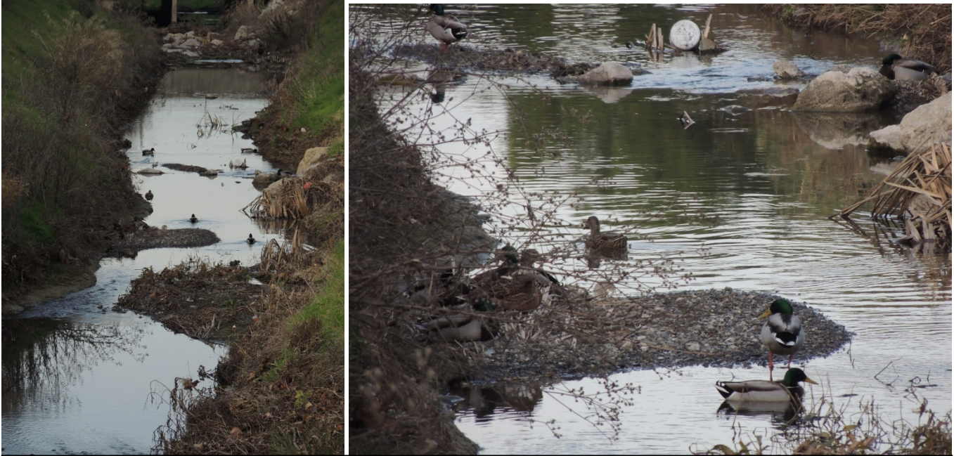
Upper Berryessa Creek looking downstream from the creek crossing at Los Coches

floodplain within the current channel. The photos below, looking upstream and downstream from the creek crossing at Los Coches, December 4, 2016, show evidence of cattail growth in the creek, development of inset floodplains, and use of the creek by waterfowl.